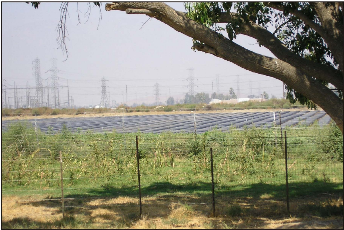
Photograph 11: Looking northwest from residential yard toward agricultural fields and electrical substation.