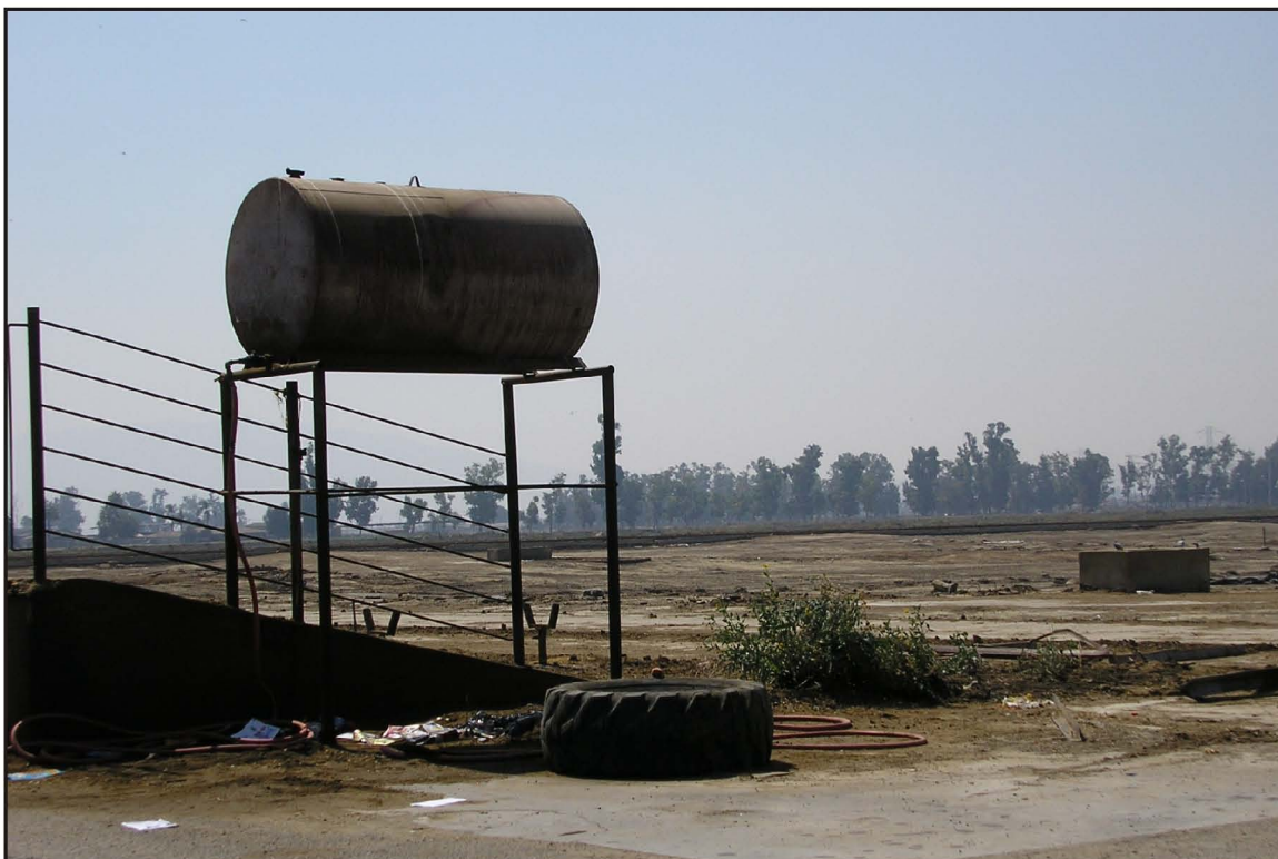
Photograph 14: Looking southwest toward aboveground storage tank, graded fields, and windrow.

Source: Michael Brandman Associates, 2006.