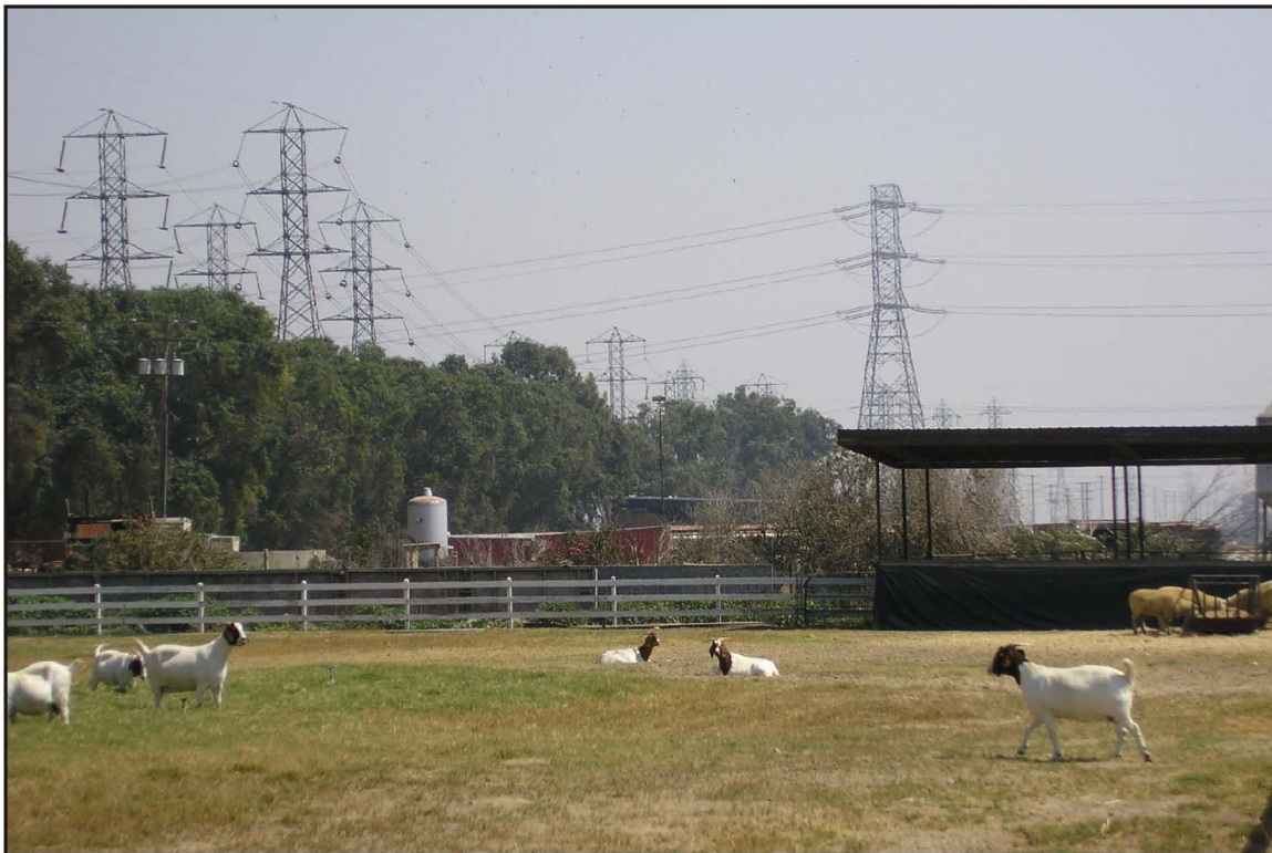
Photograph 9: Looking east toward goat pen. Windrow and electrical towers are in the background.