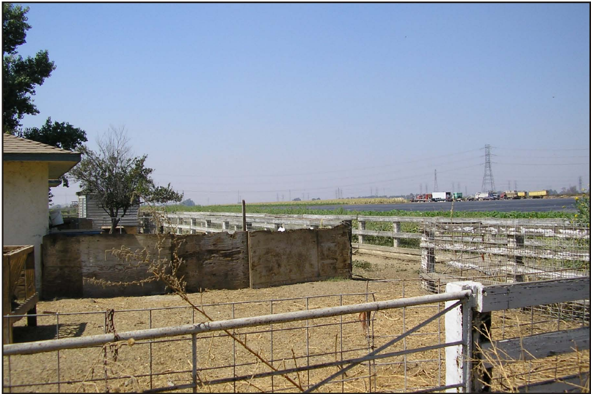
Photograph 12: Looking northwest toward residential backyard and agricultural fields.