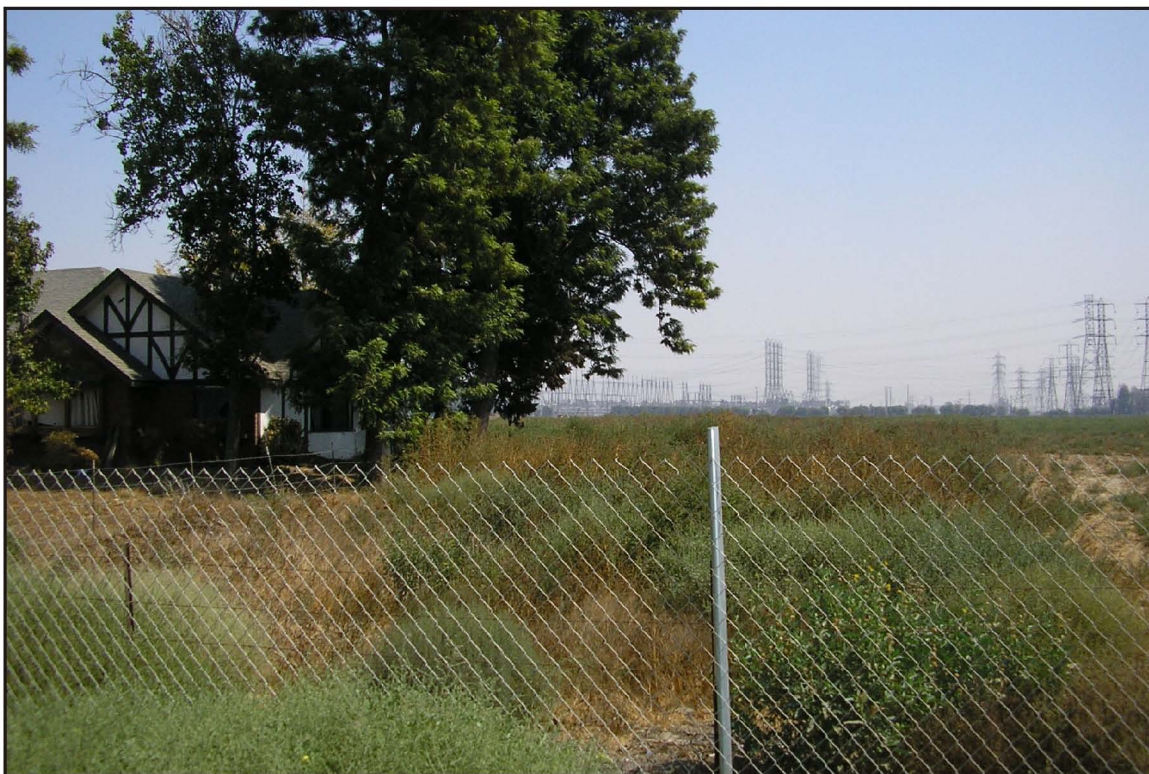
Photograph 8: Looking east toward abandoned home and electrical substation in the background.

Source: Michael Brandman Associates, 2006.