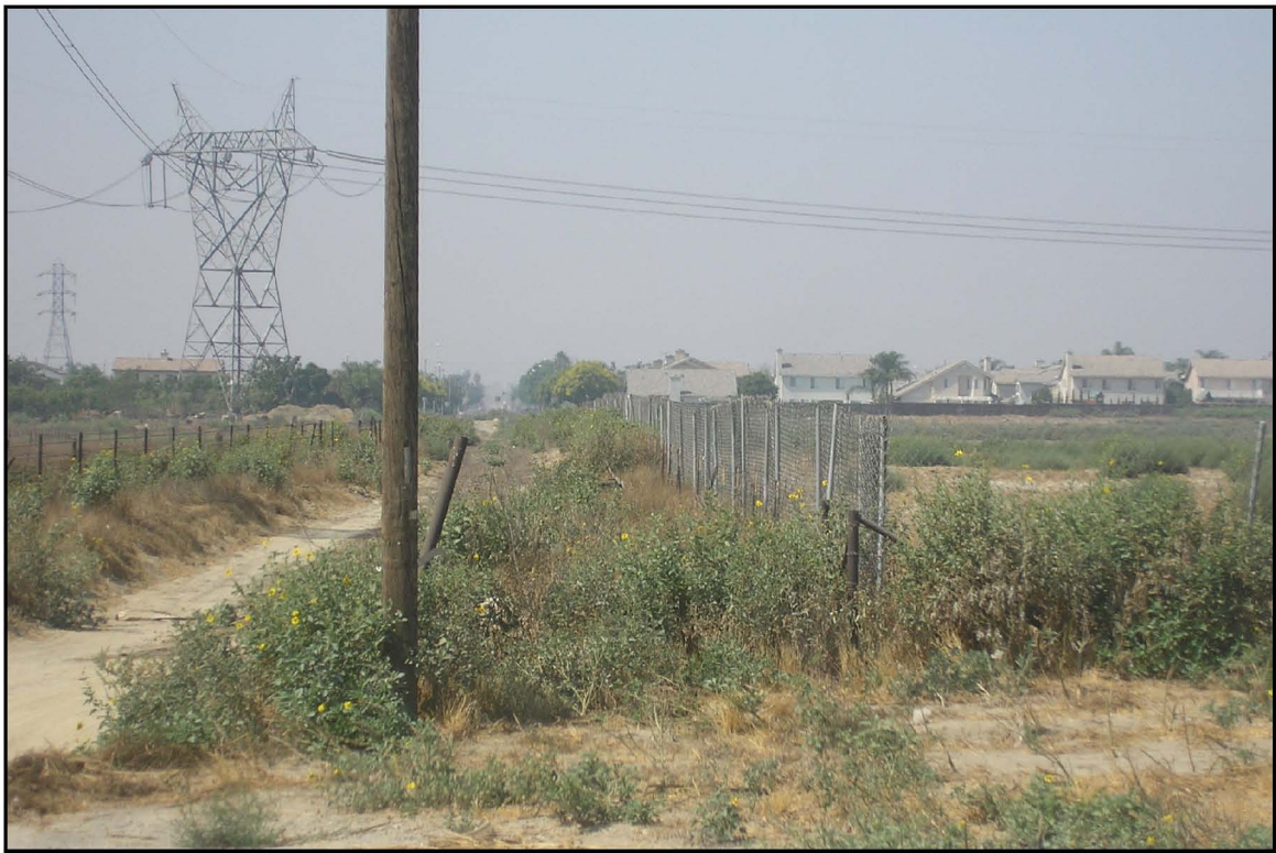
Photograph 5: Looking west across Haven Avenue. Residential neighborhood in background.