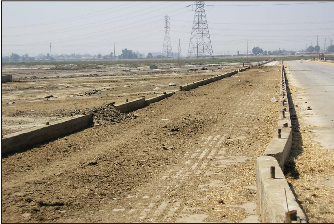
Photograph 15: Looking west toward graded fields on the left, a paved road on the right, and electrical substations in the background.