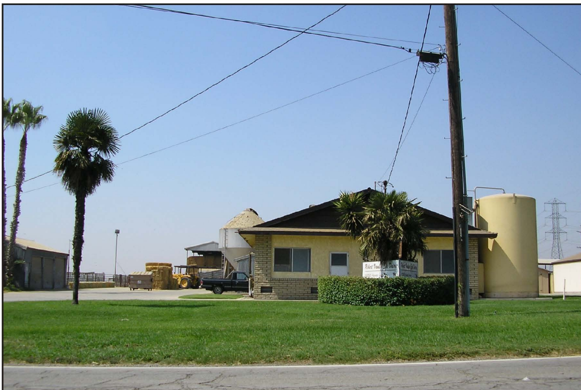
Photograph 10: Looking west toward a dairy across Haven Avenue.