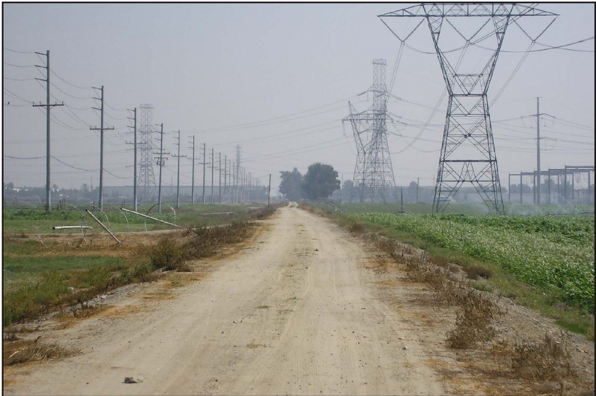
Photograph 4: Looking easterly down dirt road. Electrical towers and telephone poles line the road which extends between agricultural fields.