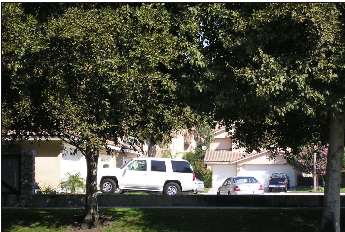
Photograph 2: Looking north toward Creekside residential subdivision across East Riverside Drive.