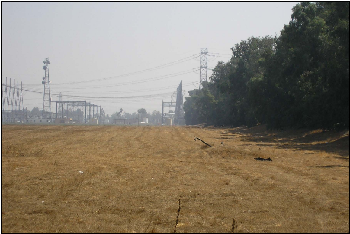
Photograph 6: Looking east toward wind rows and electrical substation.