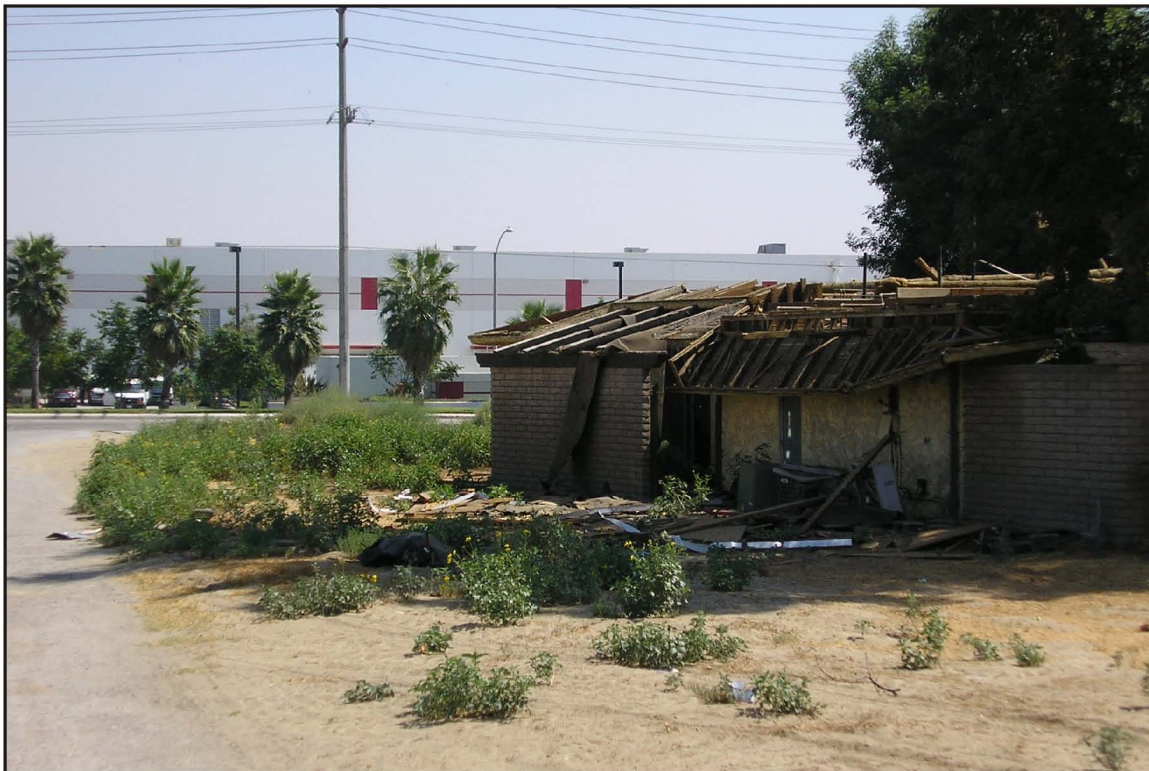
Photograph 13: Looking east toward abandoned home and business warehouse across Hamner Avenue.