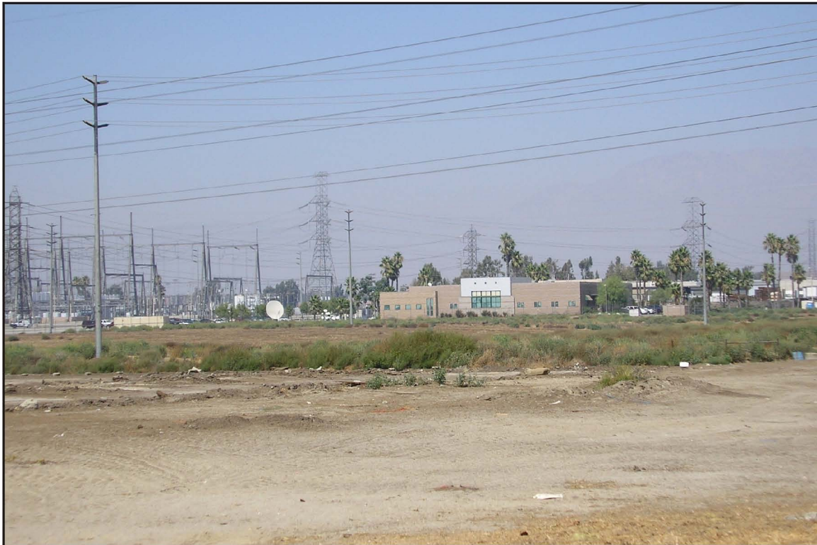
Photograph 16: Looking northwest toward Edison electricity building and electrical substation.

Source: Michael Brandman Associates, 2006.