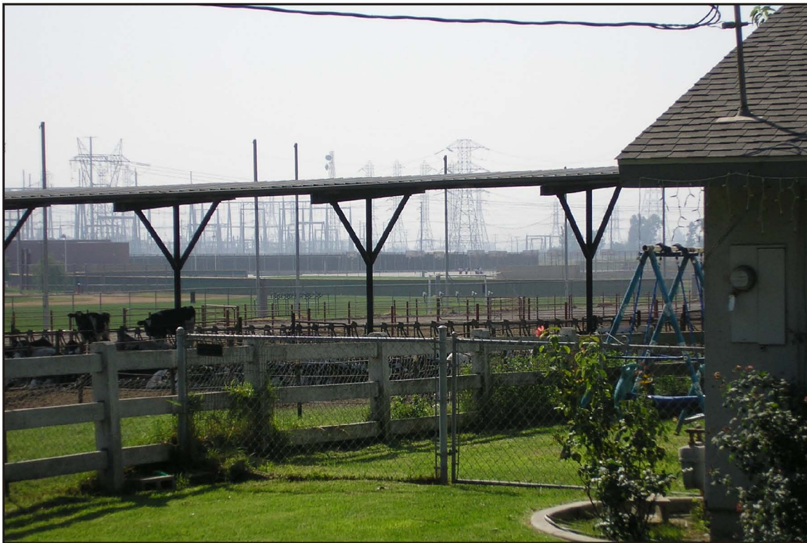
Photograph 1: Looking southeast from residential yard. Adjacent to the yard is a cow pen. Colony High School and electrical towers are in background.