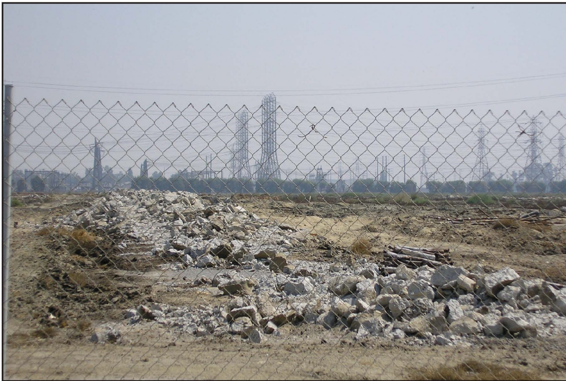
Photograph 7: Looking easterly at concrete debris in empty field and electrical substation in background.