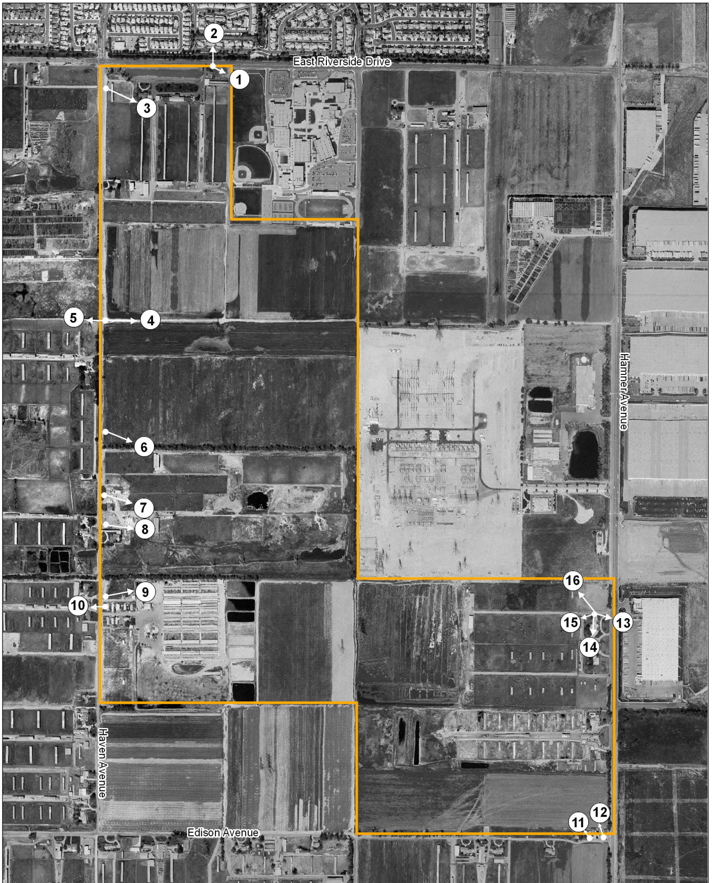
Source: Farmland Mapping and Monitoring Program 2004.