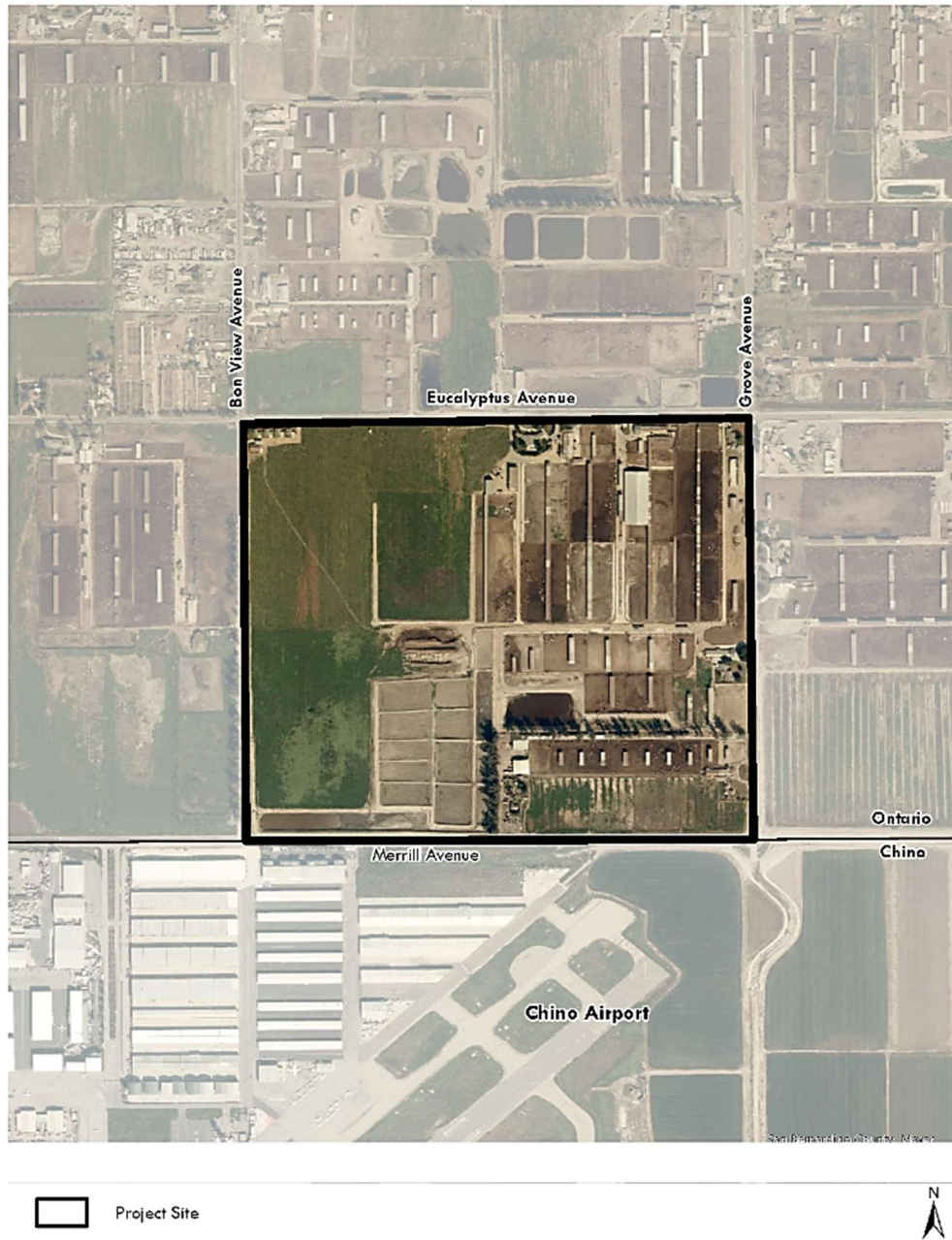
South Ontario Logistics Center Specific Plan