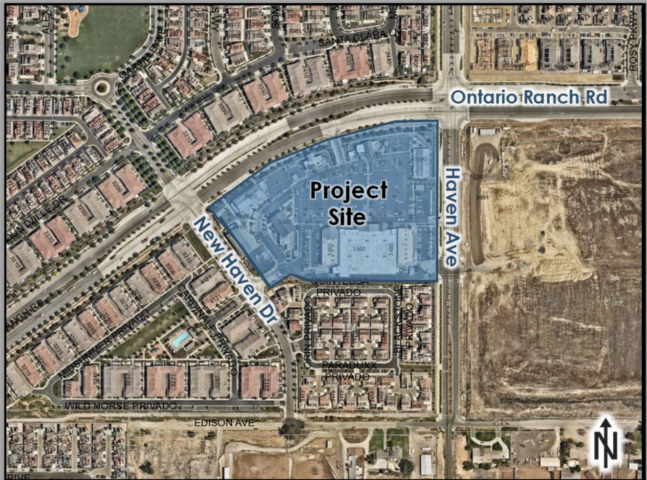
Exhibit A: PROJECT LOCATION MAP