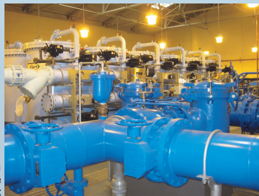
John Galvin Ion Exchange Treatment Plant