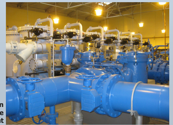
John Galvin Ion Exchange Treatment Plant