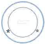
Block Wall Matrix Count

Place architect/engineer stamp & signature here: